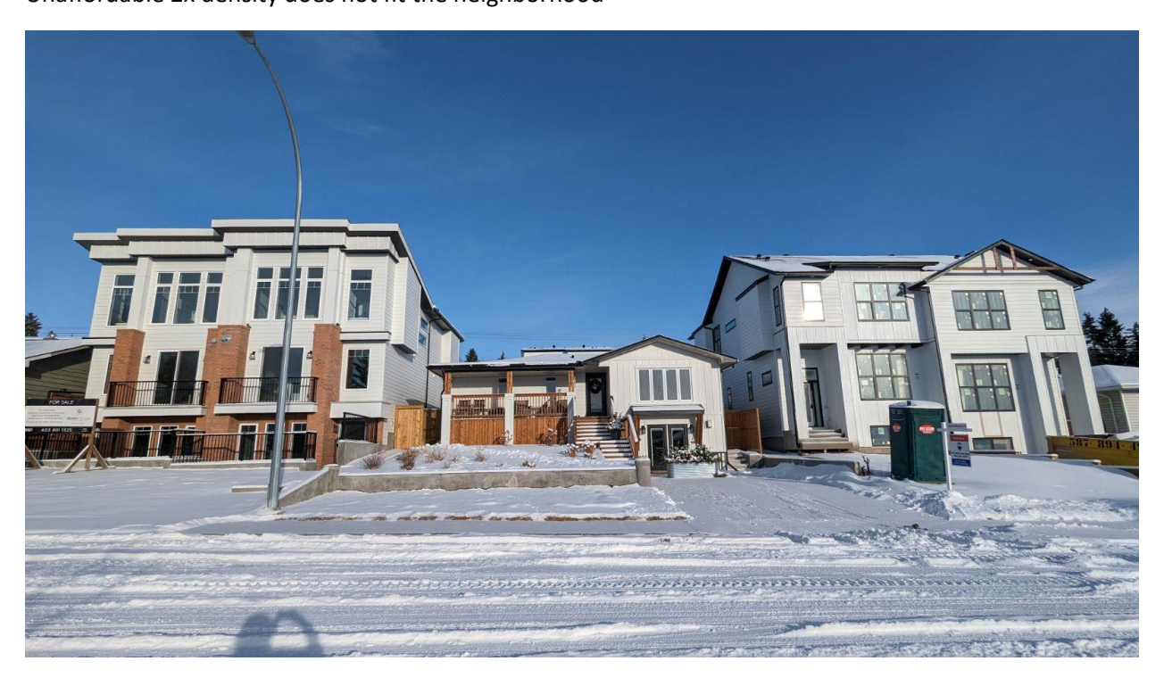
RC-2 duplexes built 2023 in Montgomery (10 metres tall)