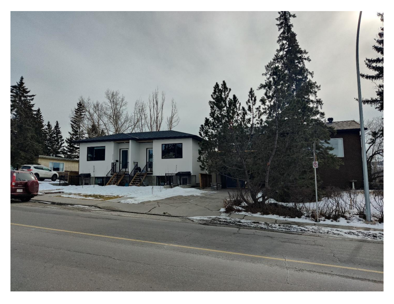
RC-2 duplex with secondary suites (4 plex) built 2023 in Montgomery (not 10 metres tall)