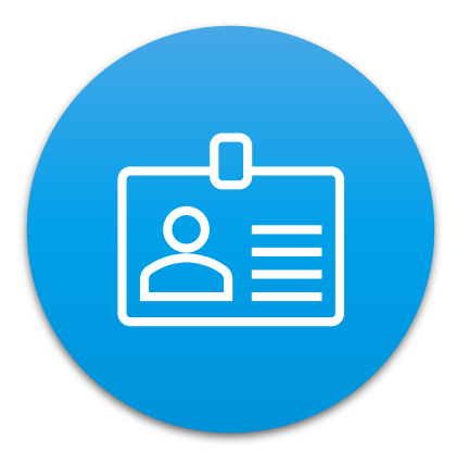
Talent and workforce