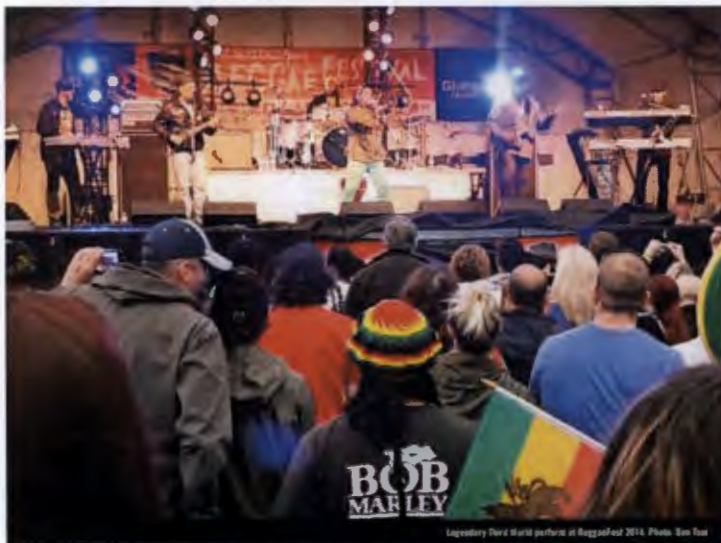
Legendary Third World perform at ReggaeFest 2014.