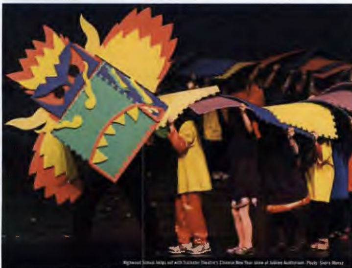
Highland Street helps out with Vancouver Theatre's Chinese New Year show at Jubilee Auditorium.

Based on Calgary Arts Development client data