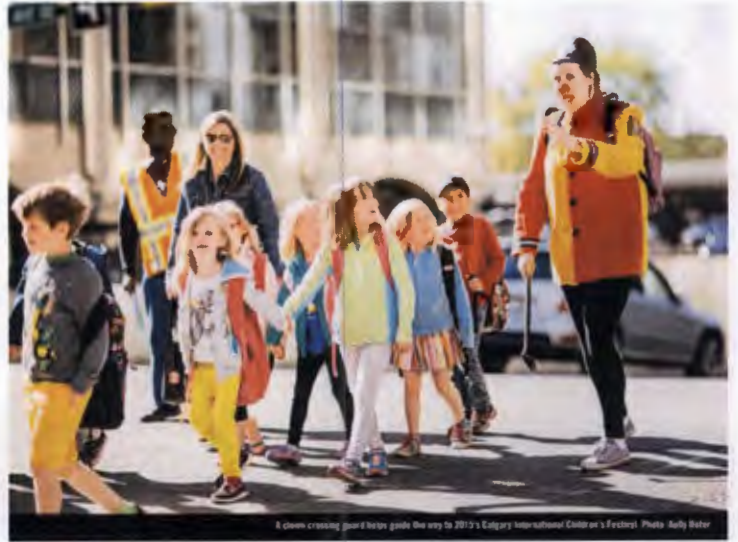
A green crossing guard helps guide the way to 2015's Calgary International Children's Festival.

ITEM: CPS2015-0397 Distribution CITY CLERK'S OFFICE