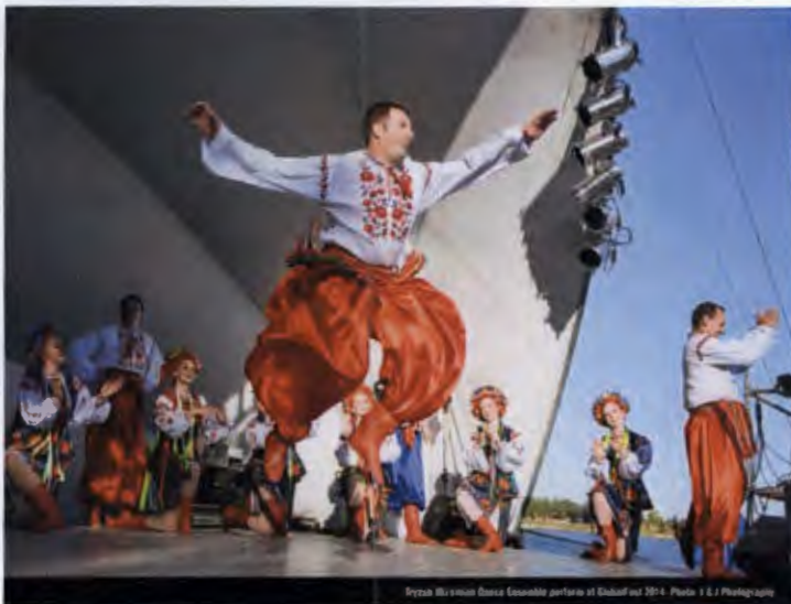
Rygan MacLean Dance Ensemble performs at Enlaid out 2014.

2014 Calgarian Engagement Survey, commissioned by Calgary Arts Development