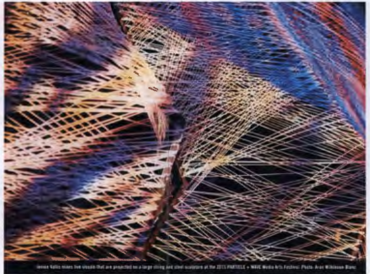
James Walle mixes the visuals that are projected to a large string art sculpture at the 2015 PARTICLE + WAVE Media Arts Festival.

Based on Calgary Arts Development client data