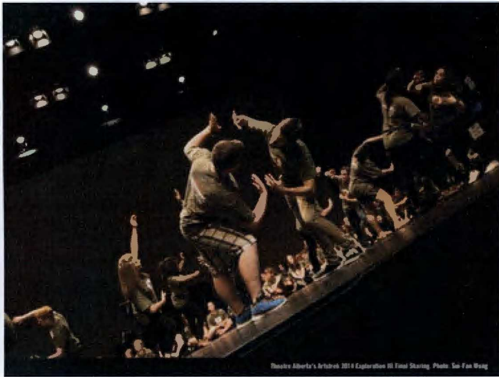
Theatre Alberta's ArtShare 2014 Exploration III Final Sharing