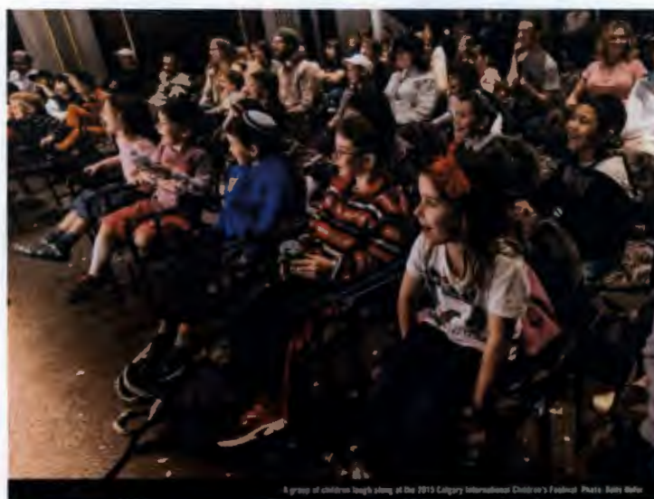
A group of children laugh along at the 2013 Calgary International Children's Festival.