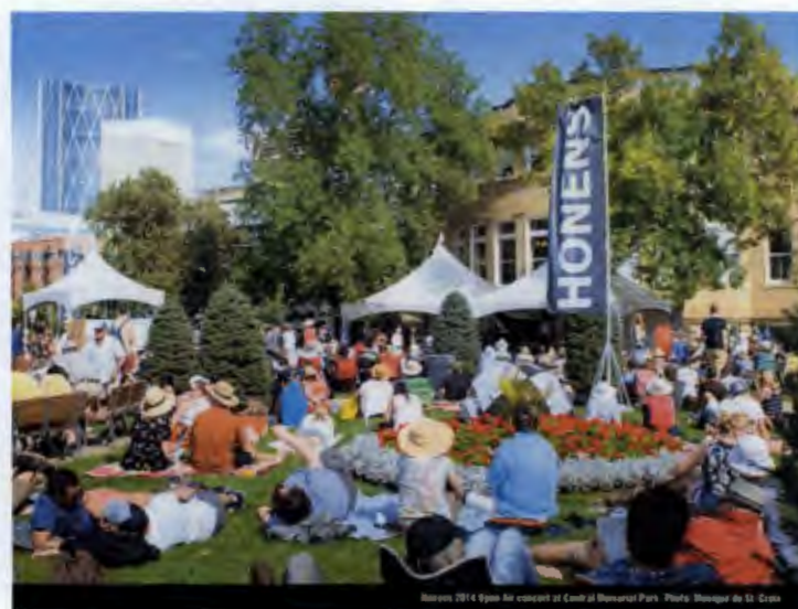
Summer 2014 Open Air concert at Centre of the Square Park.