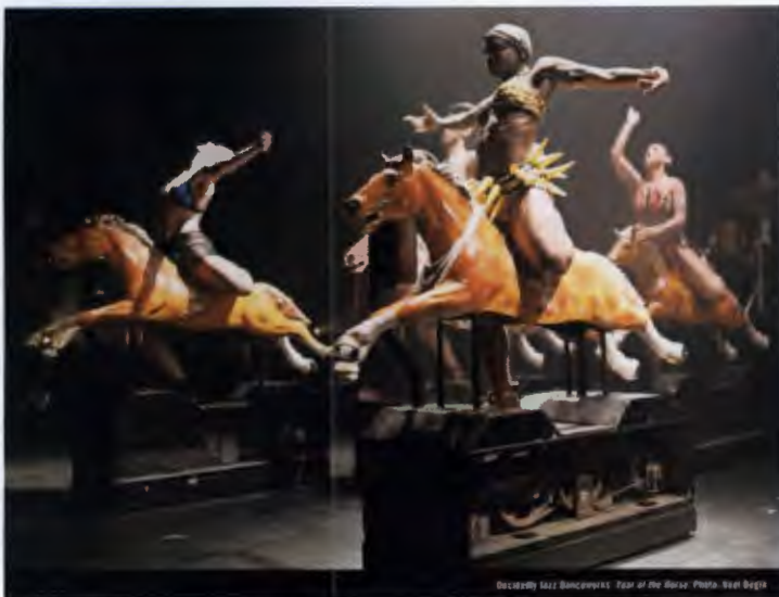
Decadently Jazz Band's 'Tape of the Horse'