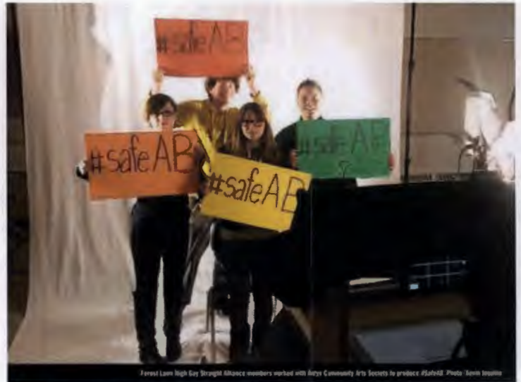
Ferret Lane High Gay Straight Alliance members worked with Bixby Community Arts Society to produce #SafeAB.

2014 Calgarian Engagement Survey, commissioned by Calgary Arts Development