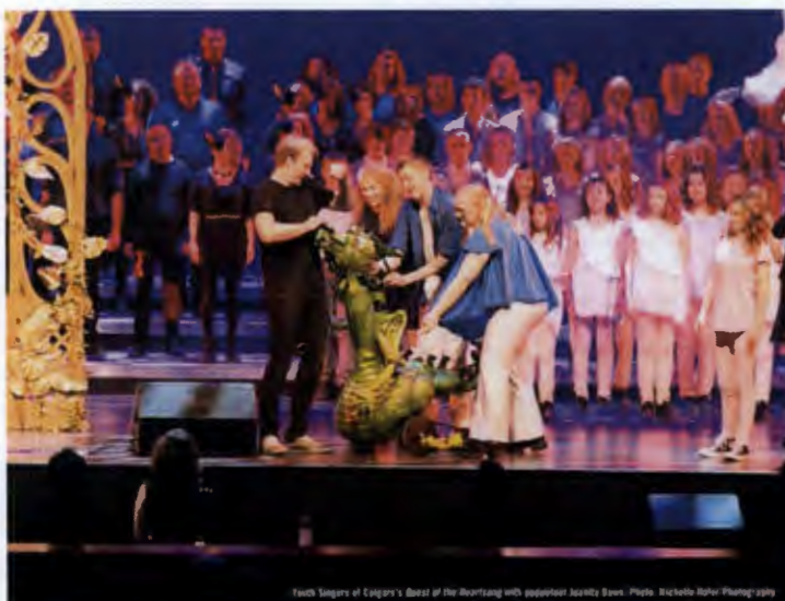
Youth Singers of Calgary's Best of the Acoustic with producer Jazzy Bae.

Based on Calgary Arts Development client data