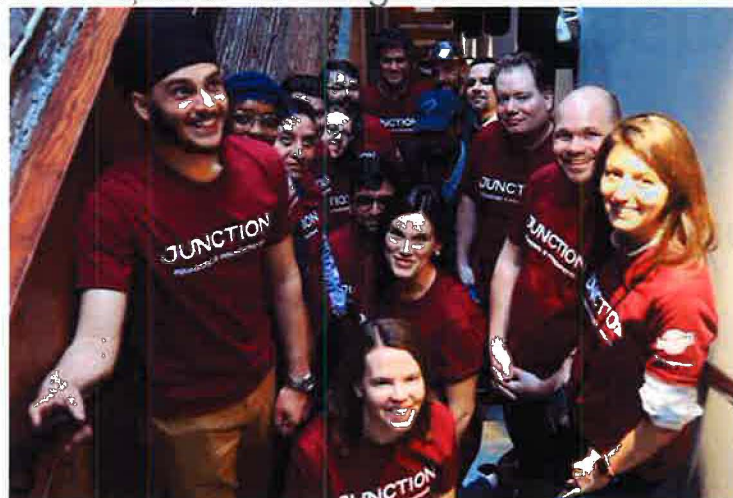
Meet the JUNCTION Cohort.

Platform Calgary is in the midst of significant transition and we want to honour this past year with you as we move forward and continue to build on our 38-year legacy. We have a new mandate, new programs, new structure, new building and new attitude.