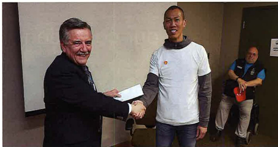
Accepting $5,000 from Shell Aviation for CF-100