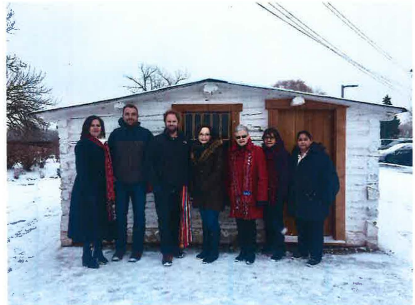
Métis Cabin opening in November 2018

Fort Calgary Preservation Society protects, manages, and preserves the historical importance of this site