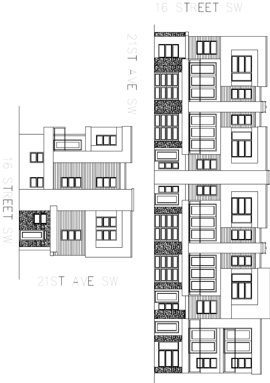
Figure 2: Potential building elevations