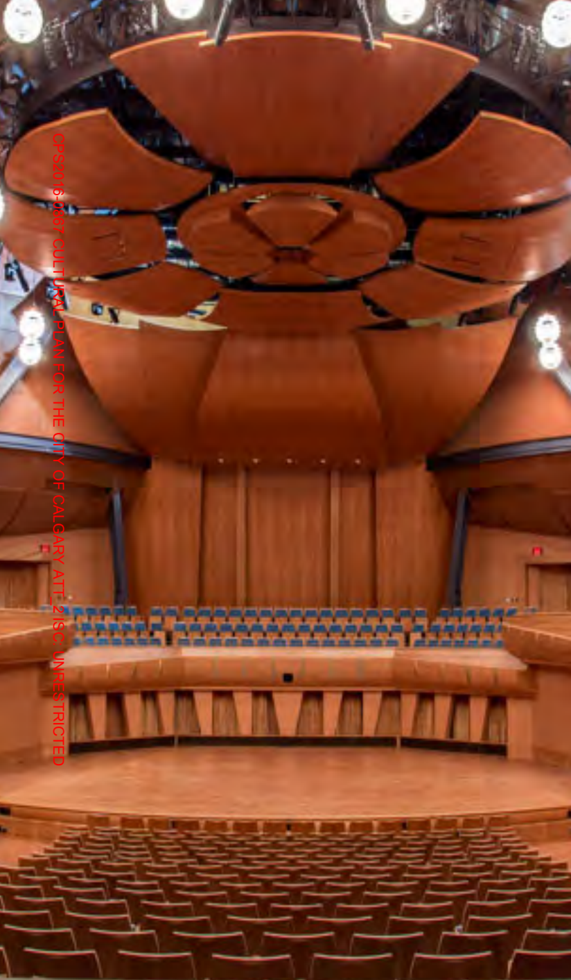
Taylor Centre for the Performing Arts, Mount Royal University