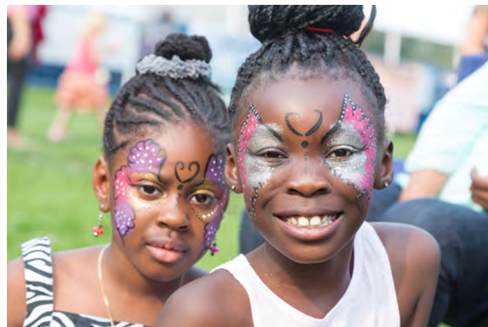
Face painting at Expo Latino