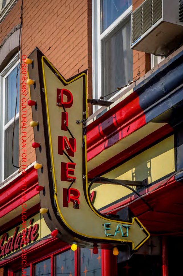
Galaxie Diner in the historic 1912 Brighden Block