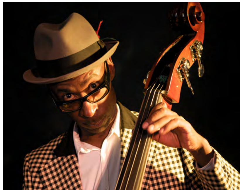
Calgary musician slaps the bass