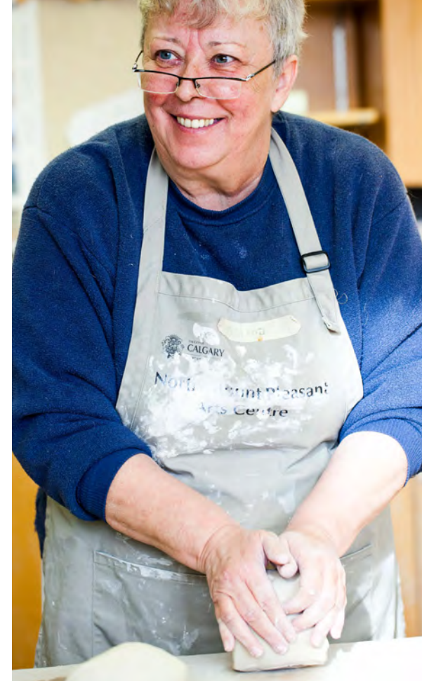
Starting a pot at North Mount Pleasant Arts Centre