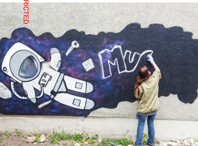
Learning street art skills - Painted City Street Art Program for Youth