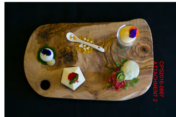
Engineered Eats at Beakerhead by The Fine Diner