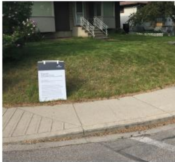
EXAMPLE OF SIGNAGE INSTALLED ON-SITE DURING R-CG APPLICATION

To supplement the usual City of Calgary notice signage that is associated with Land Use Redesignation and Development Permit applications, Eagle Crest Construction and the project team deploy on-site signage that notifies neighbours and surrounding community members of a proposed land use change. The signage outlines the land use change and development vision for the subject site and directs interested parties to get in touch with the project team via a dedicated email inbox and phone line.