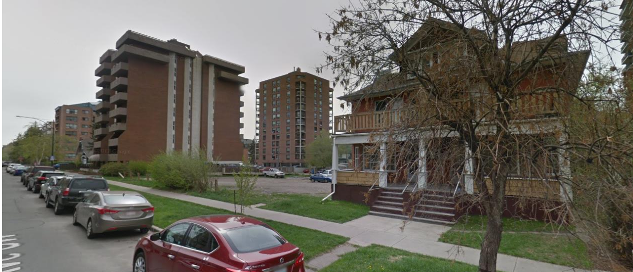
Figure 1: Community Peak Population