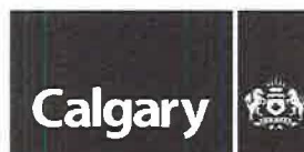
Development Permits for Cannabis Stores on Eighth Avenue South in the Downtown April 24, 2018 - September 18, 2018