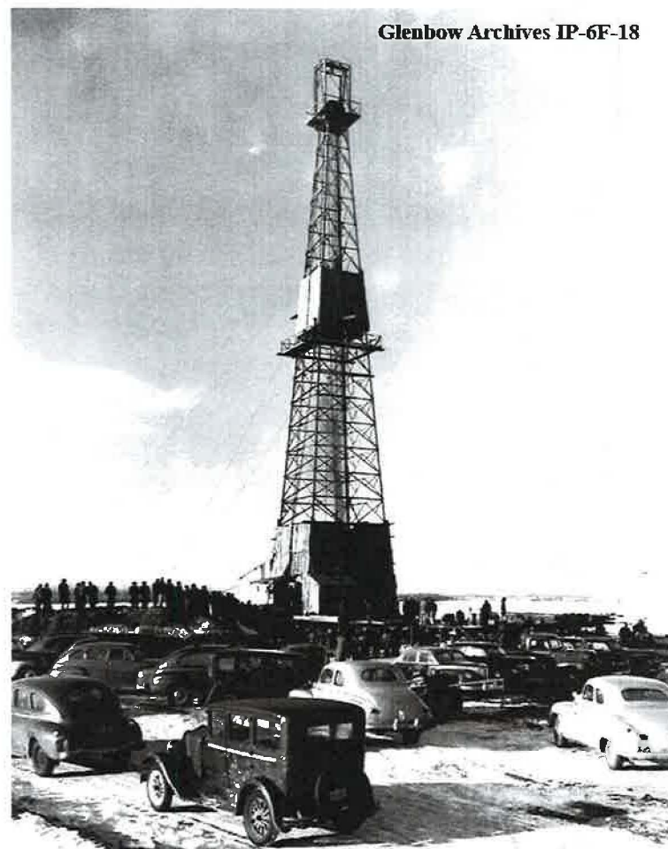
Opening day, Imperial Leduc #1 discovery well, Leduc, Alberta. February 13, 1947

It is a quality example of a small-scale modernist apartment building, with a high degree of integrity.