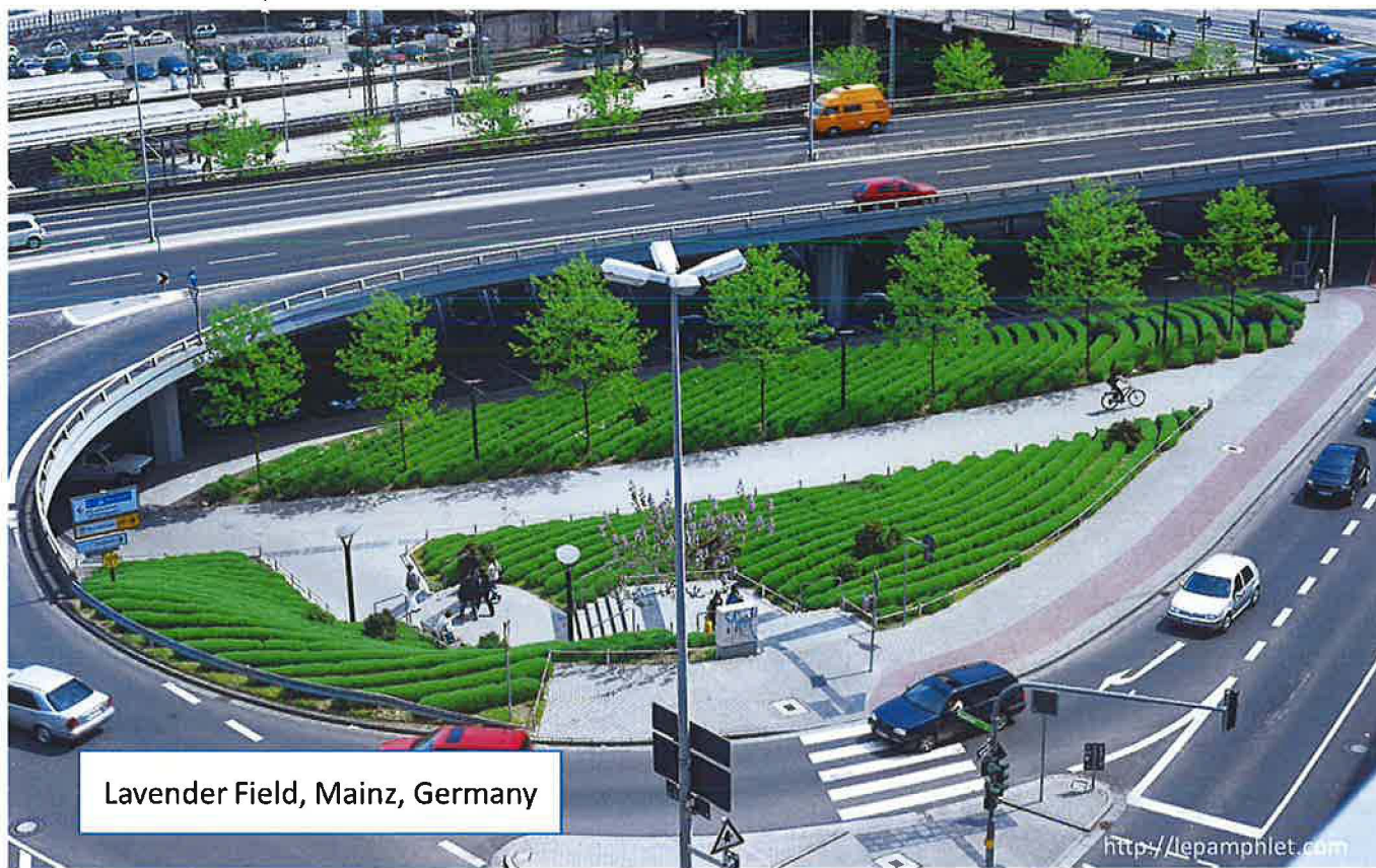
Lavender Field, Mainz, Germany