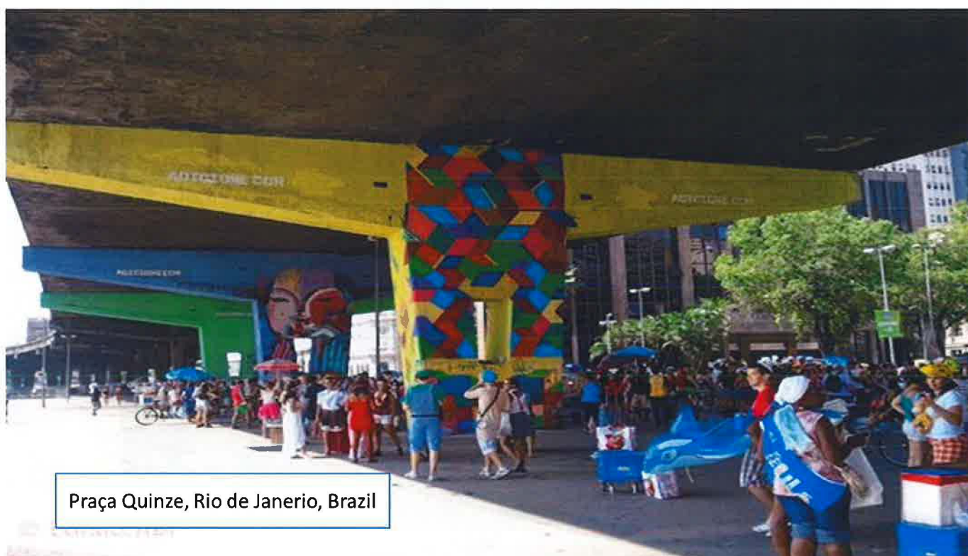
Praça Quinze, Rio de Janeiro, Brazil