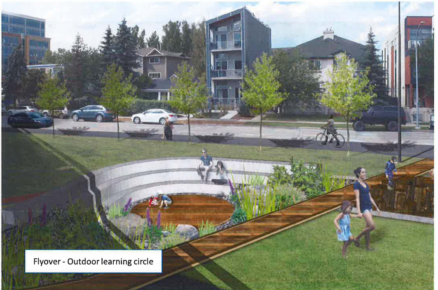
Flyover - Outdoor learning circle