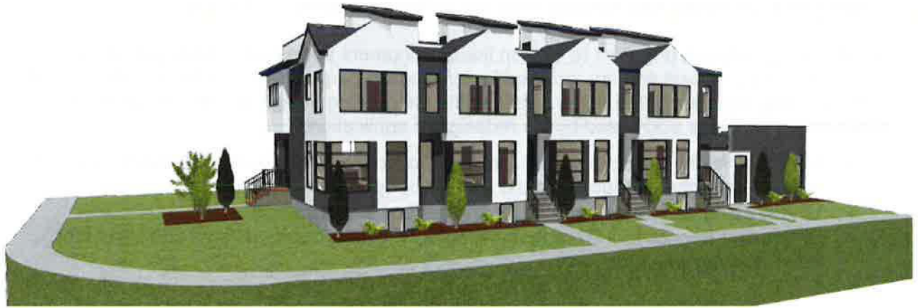
33 Street SW View