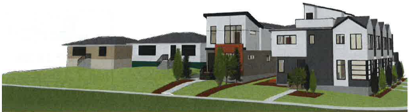
Richmond Road SW View