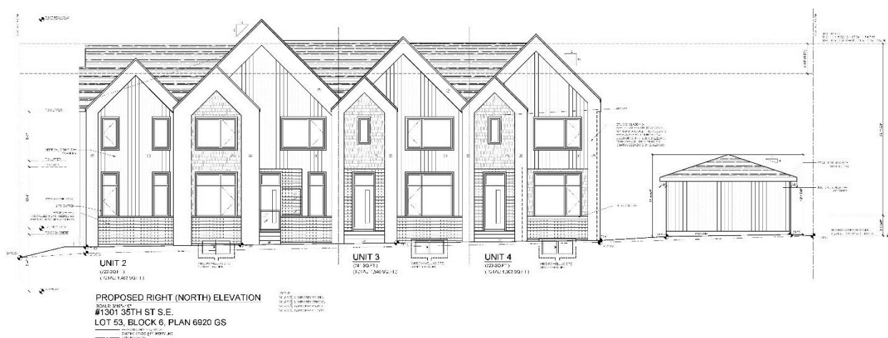
Figure 1: North elevation

Administration's review of the development permit will determine the ultimate building design, number of units and site layout details such as parking, landscaping and site access. No decision will be made on the development permit application until Council has made a decision on this land use redesignation.