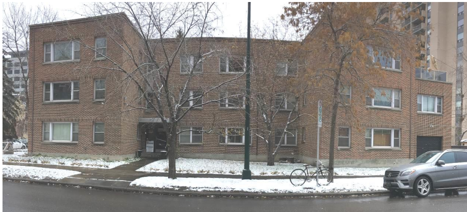
1310 – 9 Street SW Riviera Apartments

The proposed guidelines for development on the Riviera Apartments site maintains the current base land use district of Centre City Multi-Residential High Rise District (CC-MH). After a transfer of 2,988 square metres to the receiver site, the buildable floor area ratio of the donor site will be reduced to 4.04 FAR.