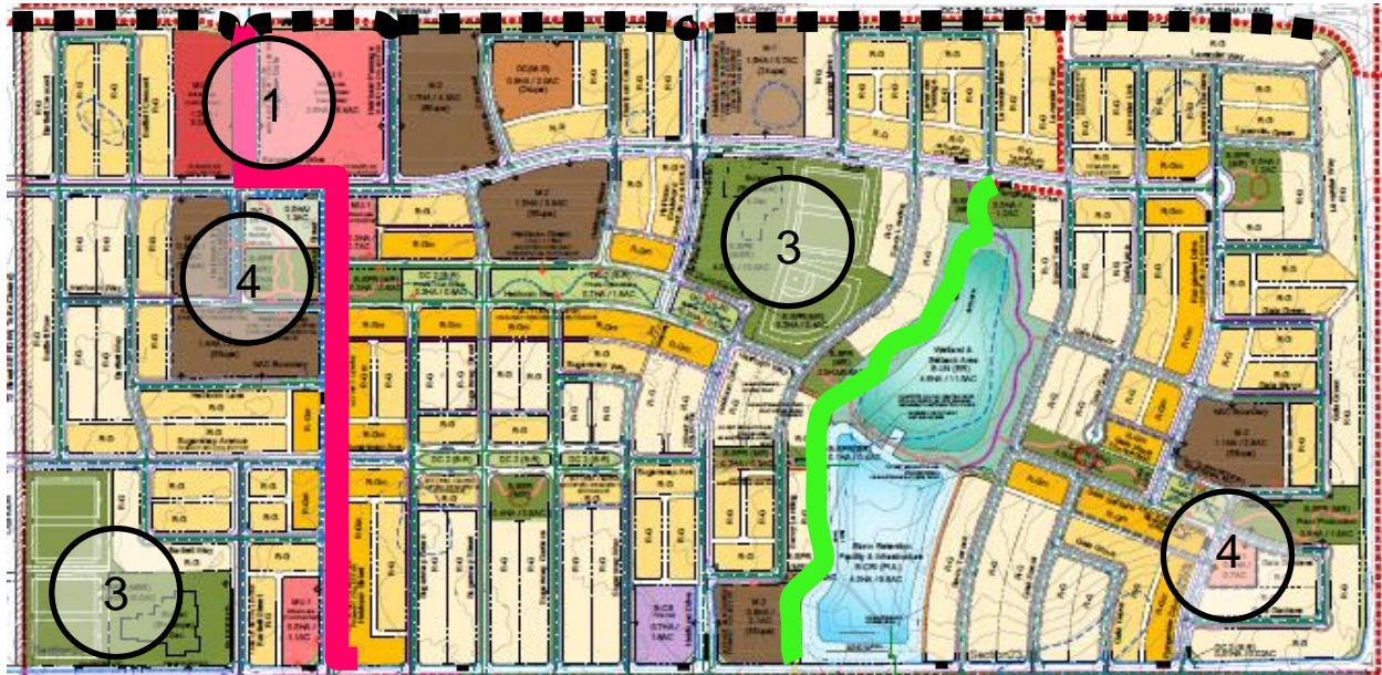
Figure 2: Land Use Concepts on Proposed Plan

The ASP contains specific requirements for development in the community of Rangeview. In accordance with the land use concept of the ASP, the proposed outline plan contributes to the complete community which includes a full range of housing types, commercial, recreational, institutional and public spaces.