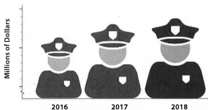
Municipal Police Budgets