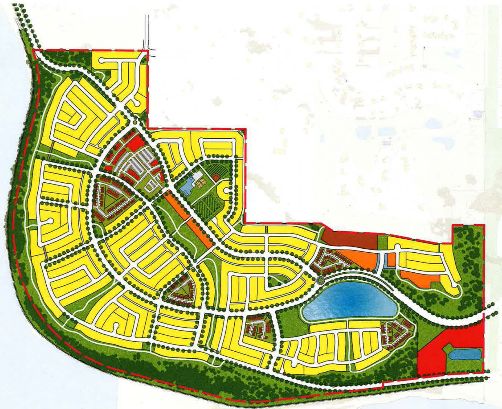
ILLUSTRATIVE PLAN - ROWAN PARK & MARQUIS