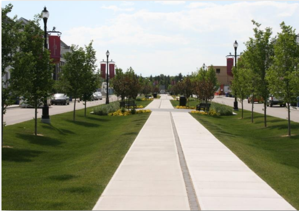
Infiltration Trench: Currie Barracks - along Victoria Cross Boulevard SW