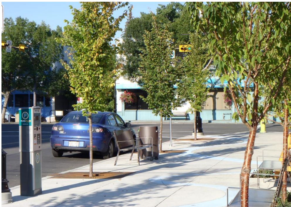
Soil cells (Final Product): 2 nd Avenue NW