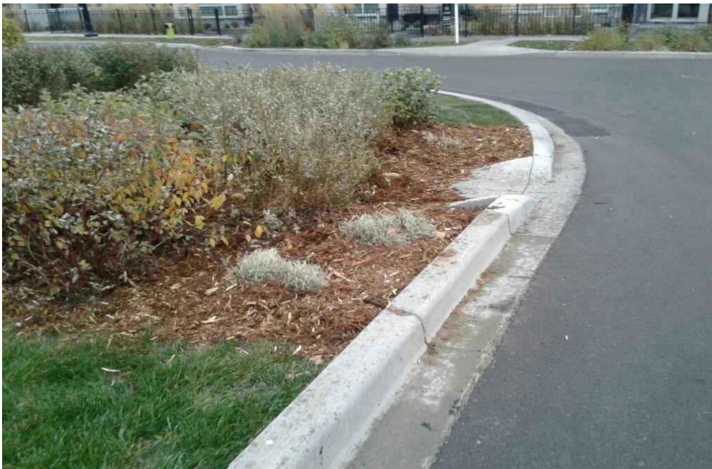
Bioretention: Currie Barracks - along Burma Star Road SW