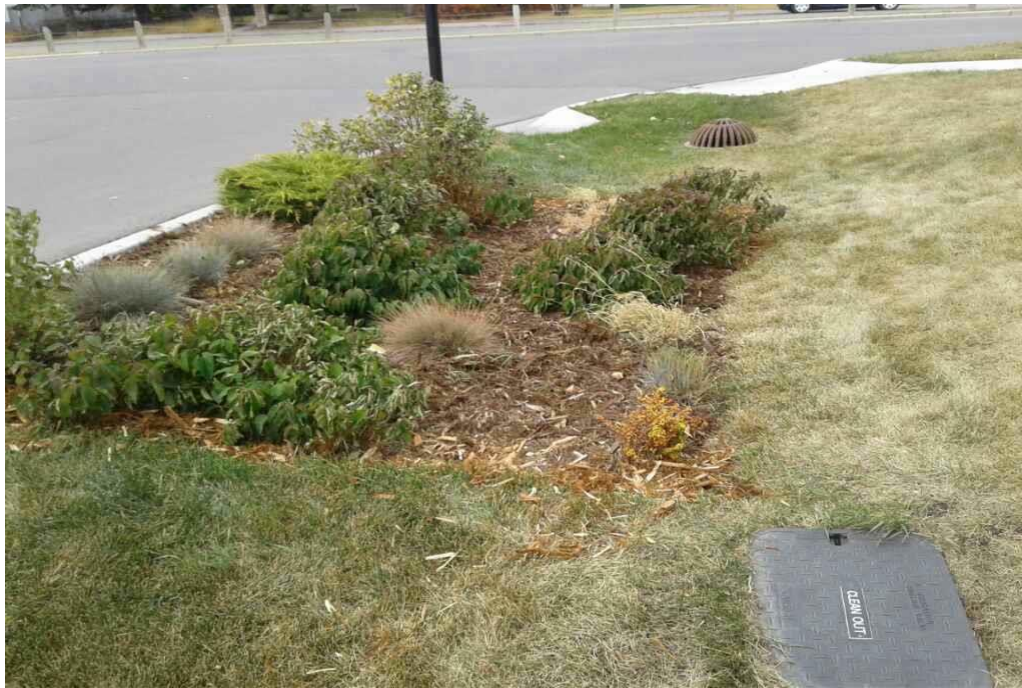
Bioretention: Currie Barracks - along Sarcee Road SW