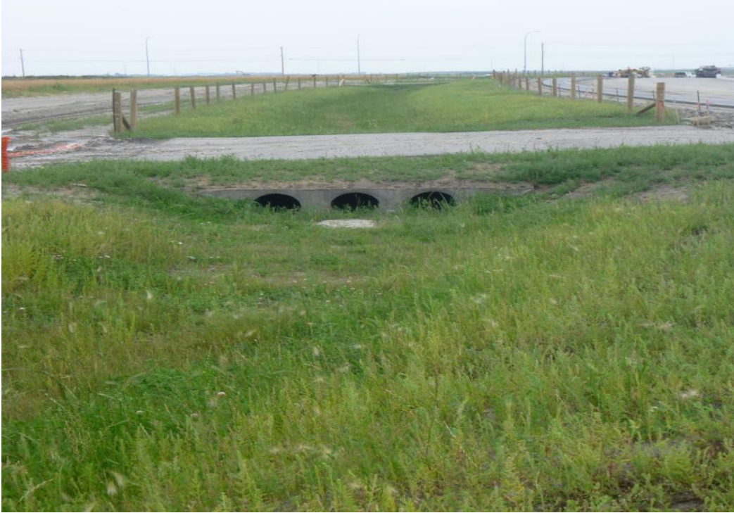
Bioswales: Jacksonport - along 108 th Avenue NE, east of 36 th Street NE; along 38 th Street NE, south of Country Hills Boulevard NE)