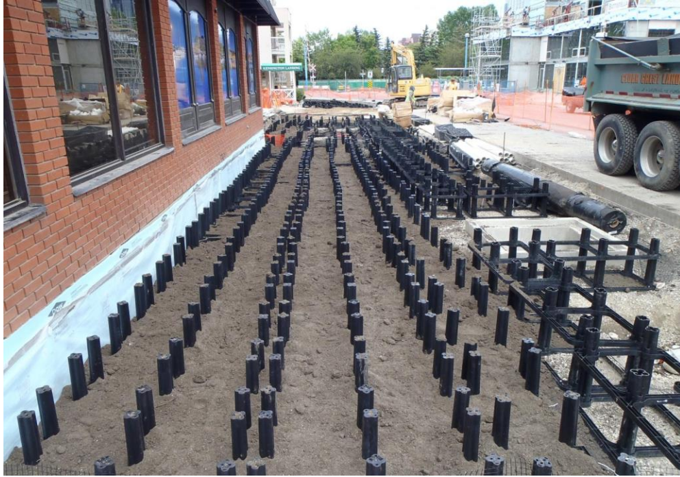
Soil cells (Under construction): 2 nd Avenue NW