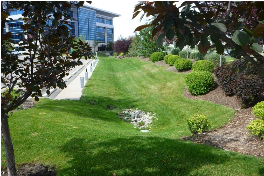
Bioswale: Quarry Park