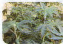
Health and Safety Issues with Marijuana