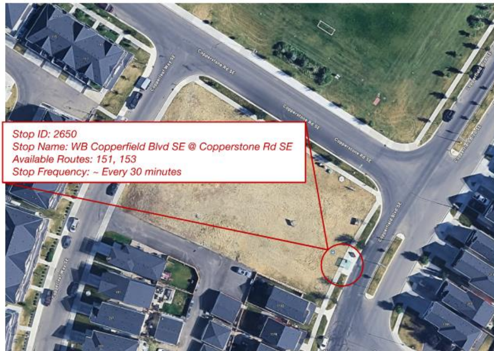
Figure 2 – Map Showing Calgary Transit Bus Stops Adjacent to Subject Parcel