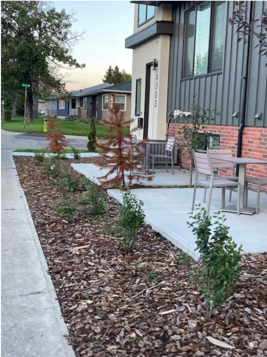
Exhibit 1 – Mature Tree Replacements