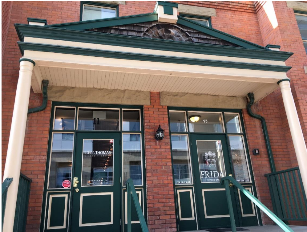
(Image 1.3: Detail view of an East Façade porch and replacement doorway assemblies)