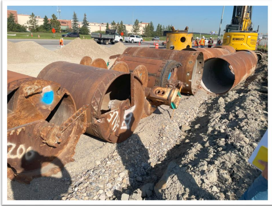
Construction undergoing at Barlow Trail and 114 Ave