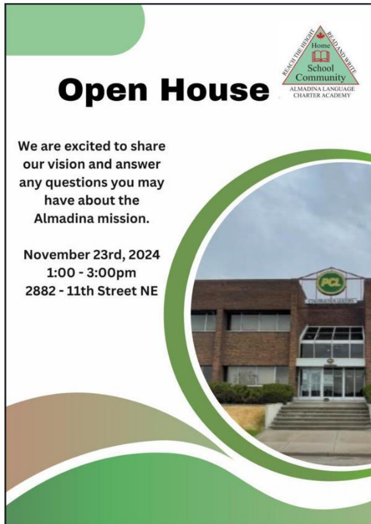
Appendix A – Flyer for the open house