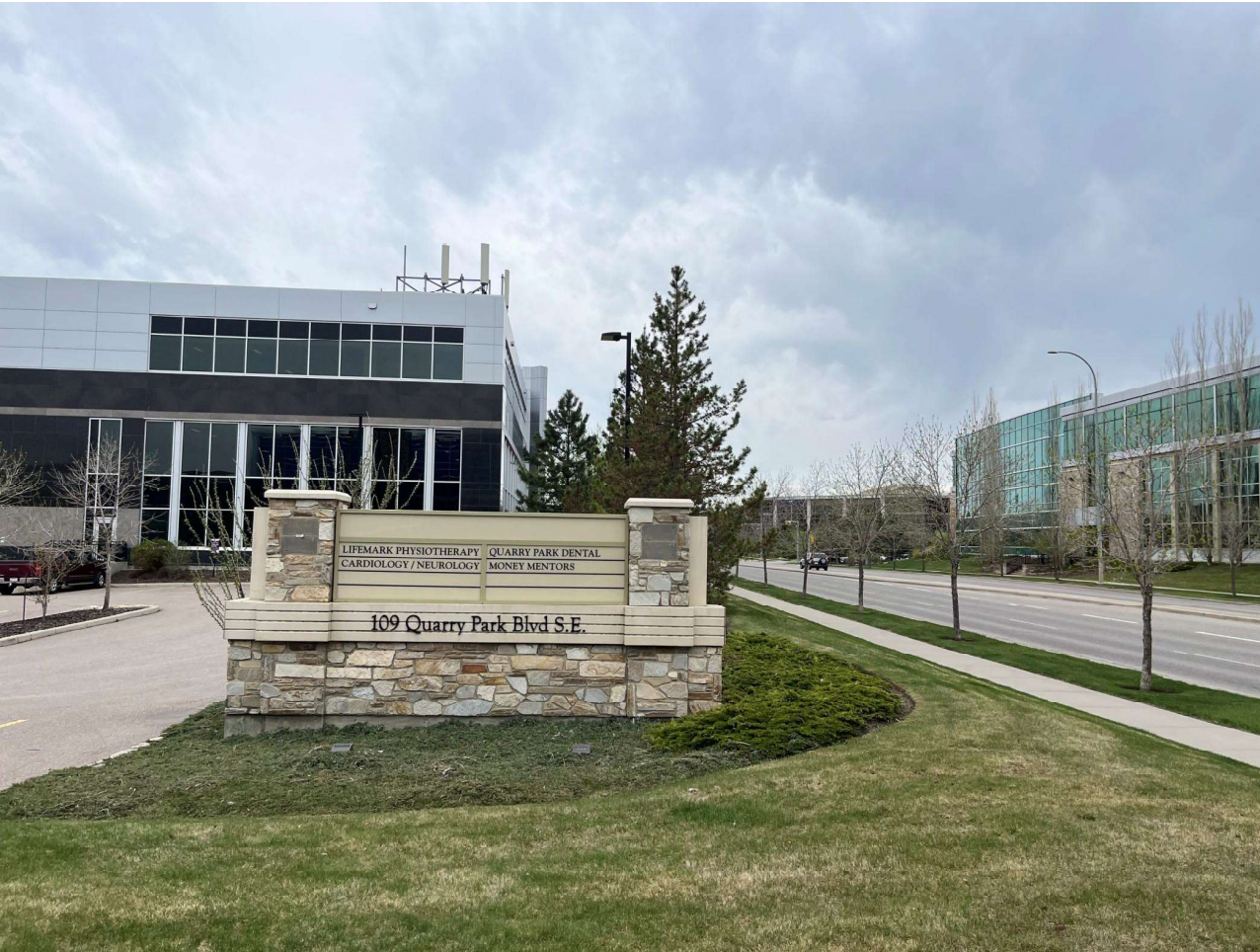
View looking west at Quarry Park Blvd from NE corner of site