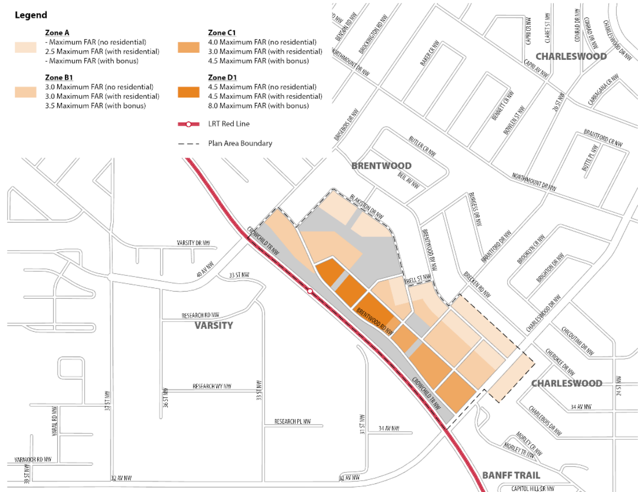
Figure 21. Maximum Densities