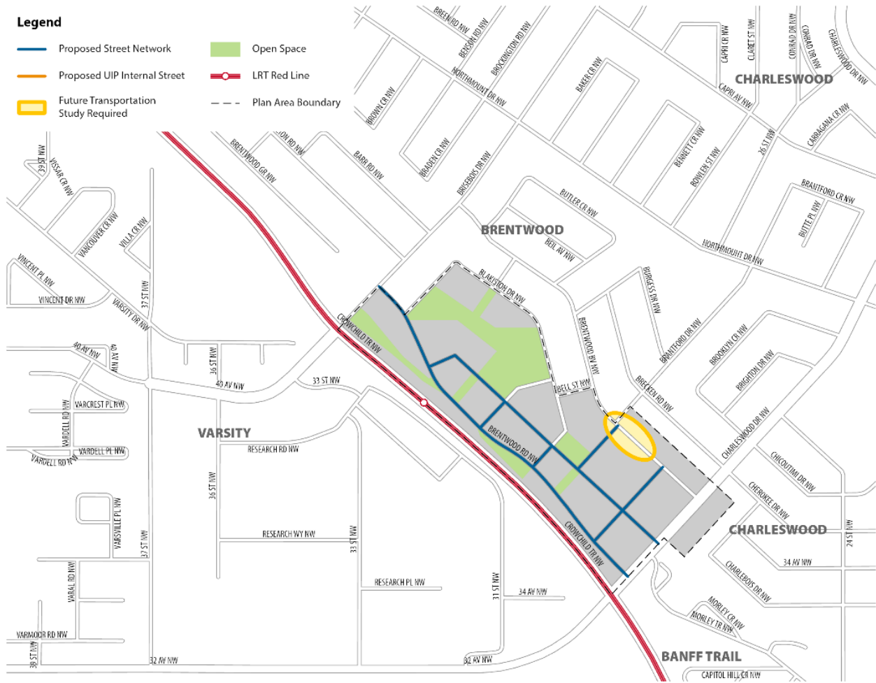
Figure 8. An Integrated Street Network