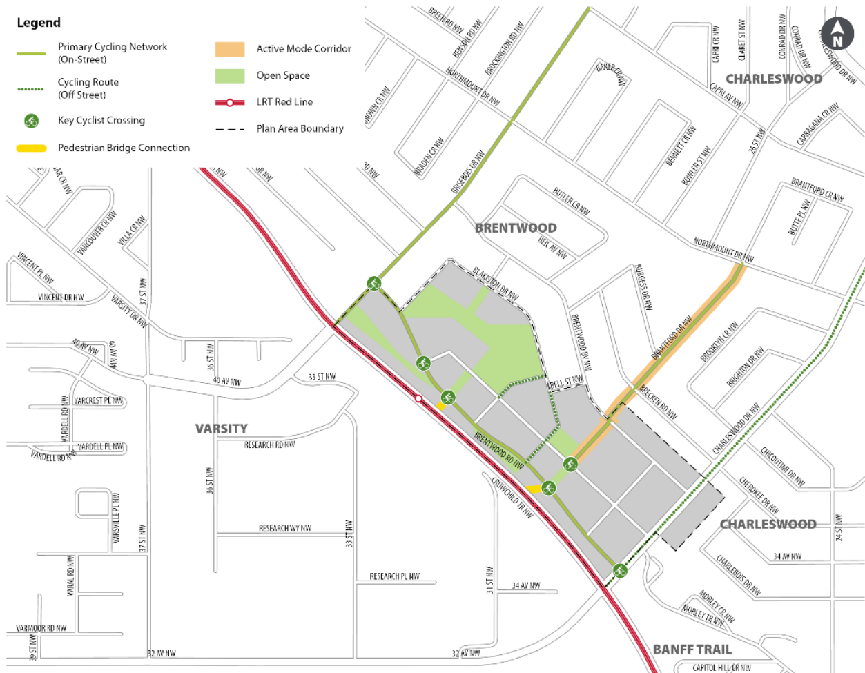
Figure 10. The Bicycle Network