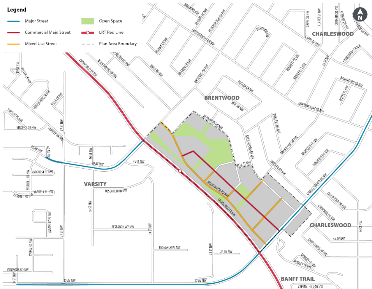
Figure 12. Character Based Street Typologies