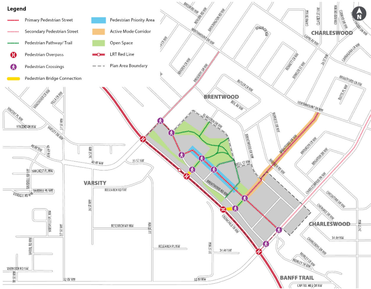
Figure 9. The Pedestrian Network