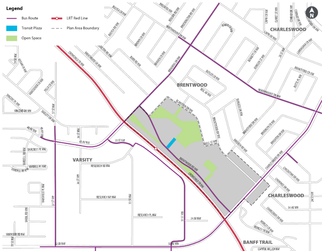
Figure 11. The Transit Network