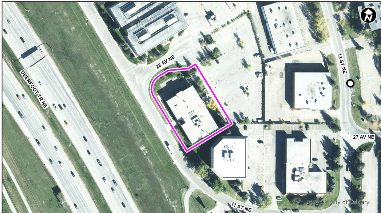
Aerial Photo of subject site at 2882 – 11 Street NE.