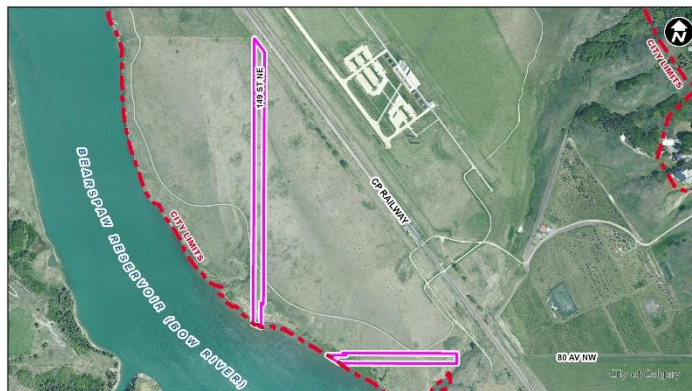
Proposed Land Use Map