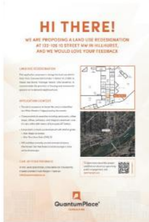
Hi There signs placed on the site