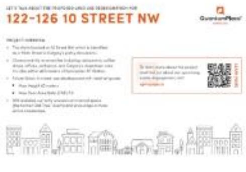
Example of the materials used to advertise the public engagement events