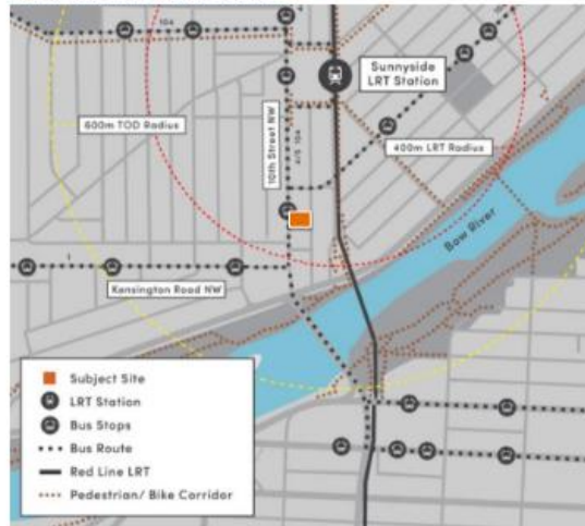
Transit Access from 122-126 10 Street NW