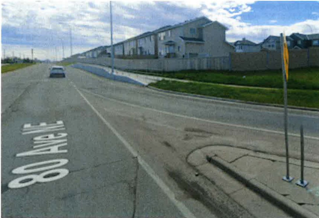
@ intersection of 80 Ave. NE and Metis Trail

The safe cycling empty sidewalk on the right in the picture above, is the only corridor leading directly from Saddletowne Circle to Metis trail, where a regional off-street pathway exists which will connect cyclists to the Northeast Athletic Complex.