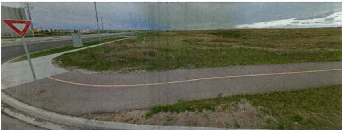
Photo credit: (Google Maps Street View) gap at end of above multi-use pathway along Country Hills Blvd. NE from 36 Street NE heading towards the airport/Barlow Trail NE

Photo credit: (Google Maps Street View) under-utilized sidewalk connecting to multi-use pathway @ intersection of 36 Street NE and Country Hills Blvd. NE heading towards the airport/Barlow Trail NE