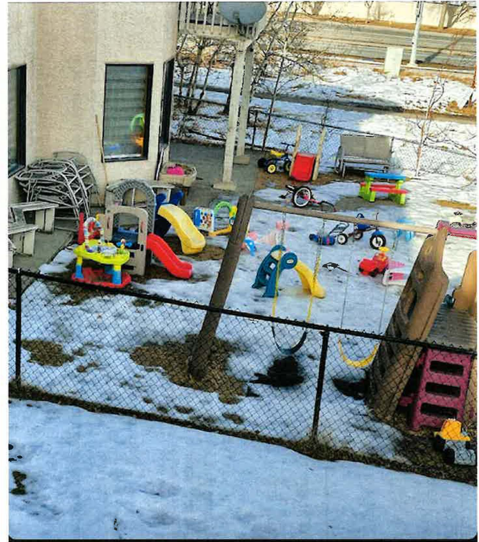
Current residential side setback view and play structures. This would not change under new proposal due to inclusion of 3 backyard parking spaces inside fence, past the tree.