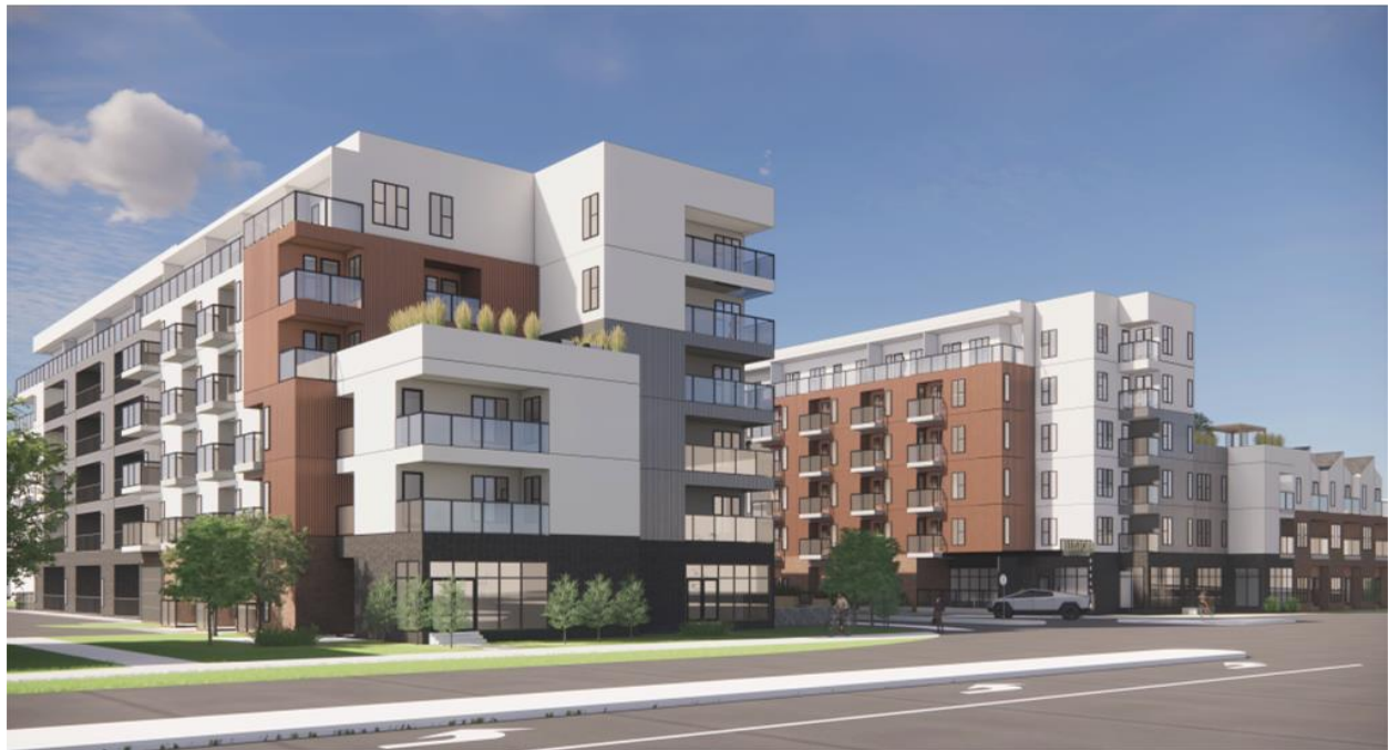
ELLISTON VILLAGE- PHASE 4 LAND USE APPLICATION PACKAGE