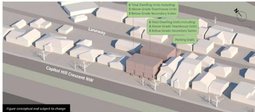
Figure 2: Conceptual Diagram for Development Proposal