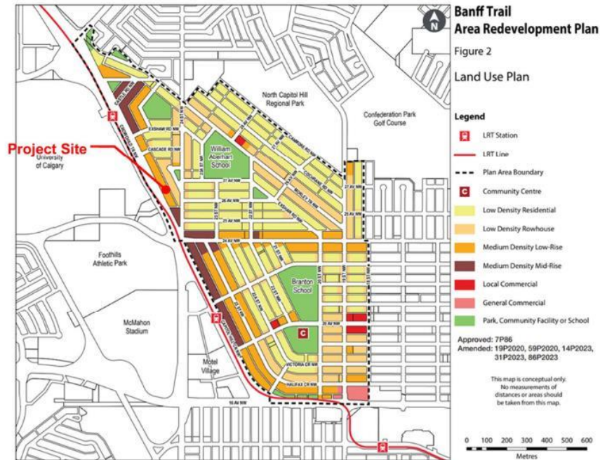
Figure 4: Land Use Plan from Banff Trail Area Redevelopment Plan