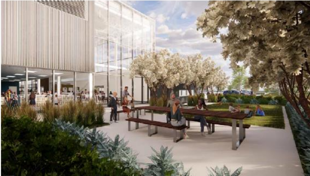
Figure 3: Outdoor Learning Space