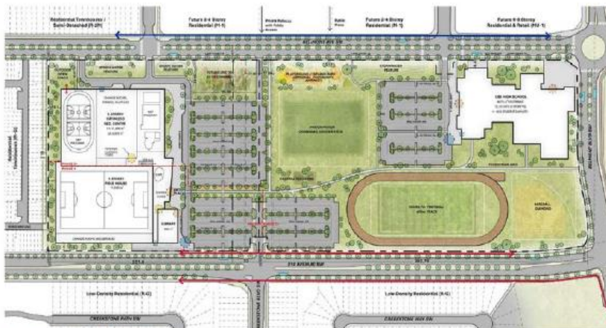
Figure 1: 2022 Master Plan

The project will be the first phase of the development from the 2022 Master Plan on the Joint Use Site (JUS). The JUS is 34 acres divided into a Civic Site and a School Site, separated by a utility right-of-way.