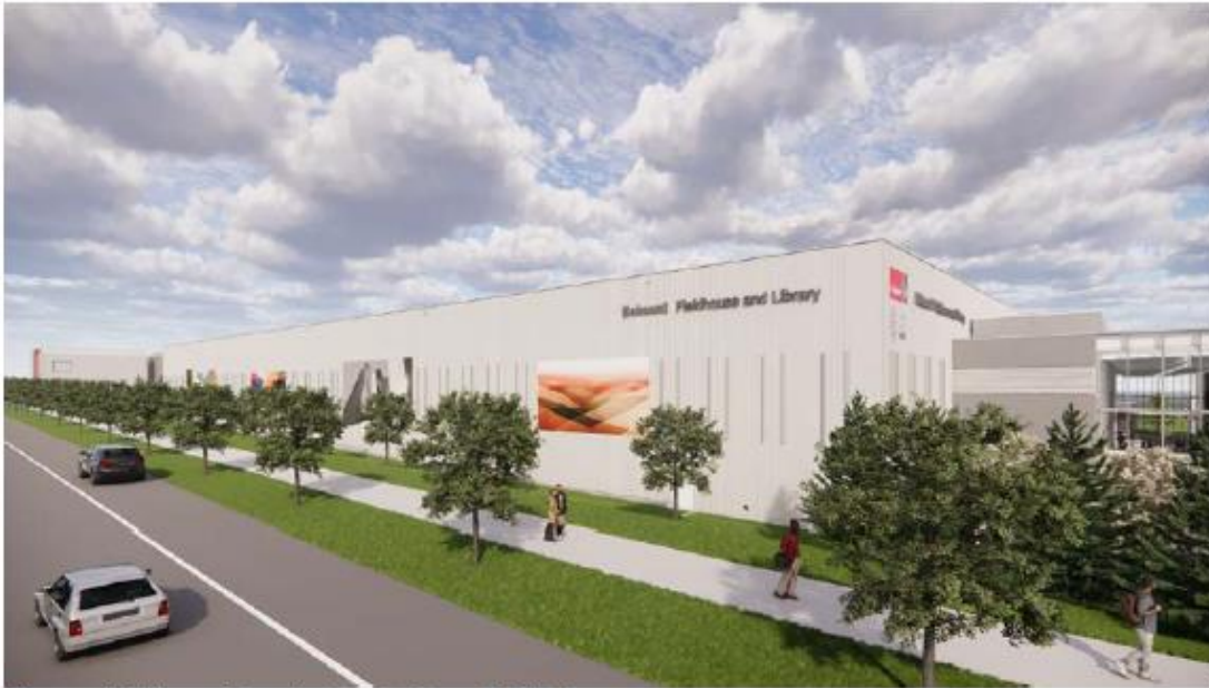
Figure 4: View of South facade from 210th Avenue