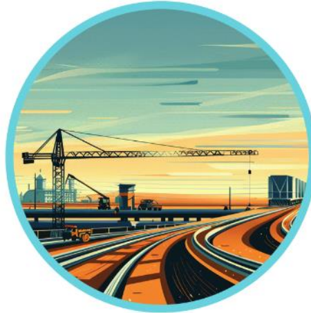
Investment in public projects and local services