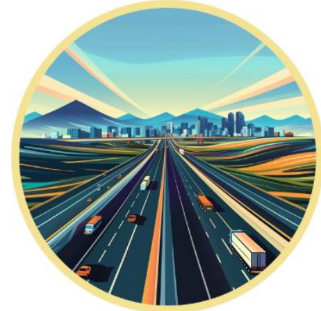
Access to markets across the continent and beyond

Our Vision: A historic regional collaboration to activate an inland port and logistics hub that will secure critical supply chains, create good paying jobs, drive industrial activity and economic growth, and connect us to everywhere.