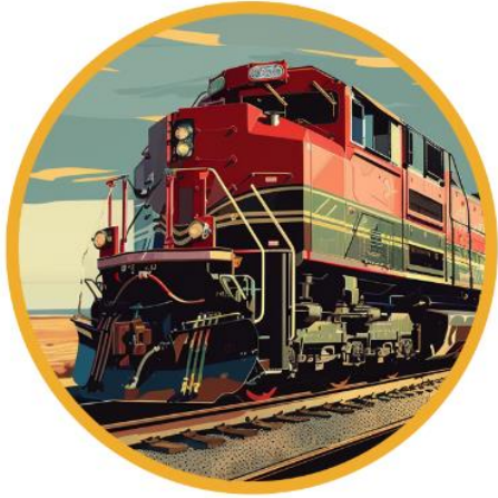
Industrial and manufacturing lands with direct rail access