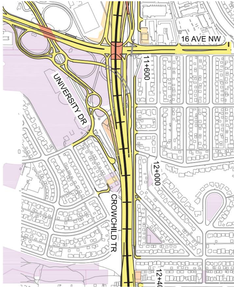
Source: TT2017-0329 Crowchild Trail Study - Final Report - Att 6.pdf