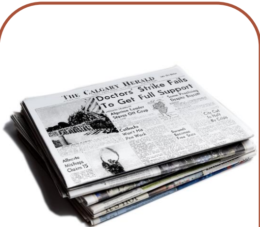
The Calgary Herald