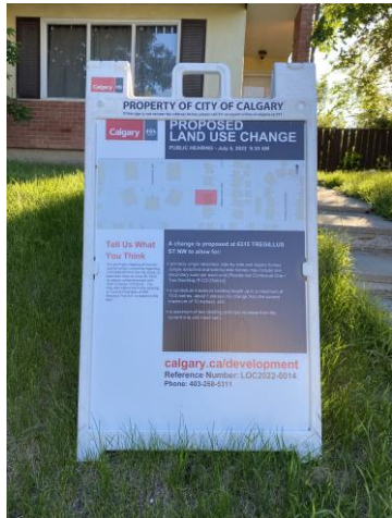
Notice Posting Signs