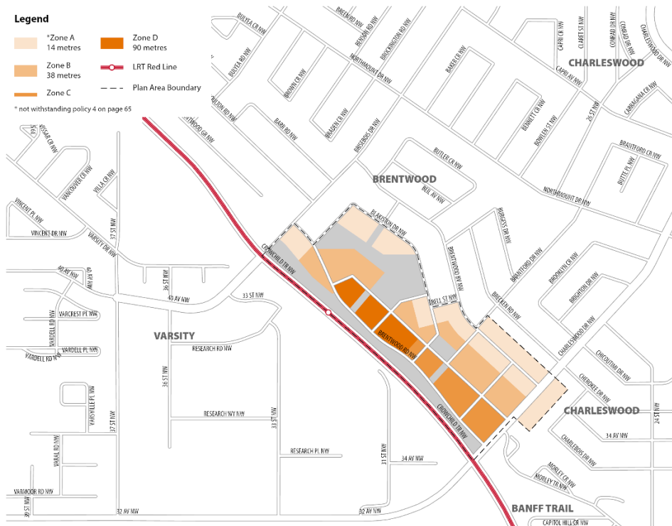
Figure 23. Maximum Building Heights