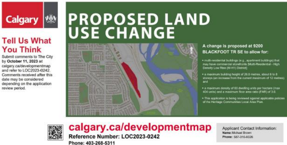
Example of the materials used to advertise the public engagement events