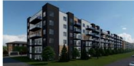
Conceptual image of the development