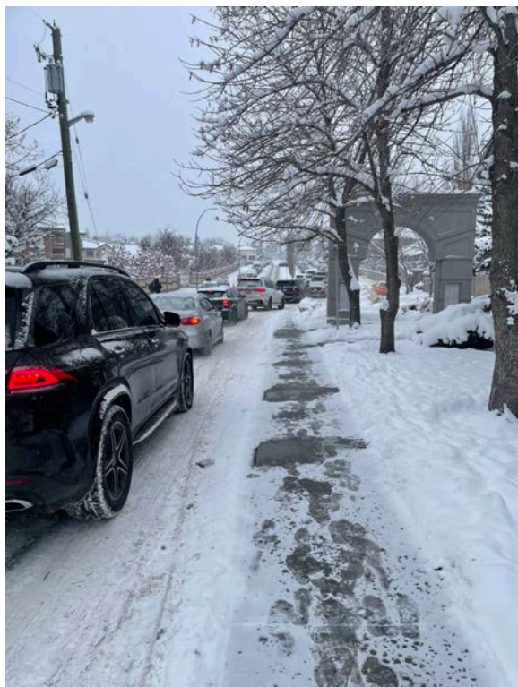
Taken facing West on 14th avenue, standing within the Lookout at Christie Park complex.