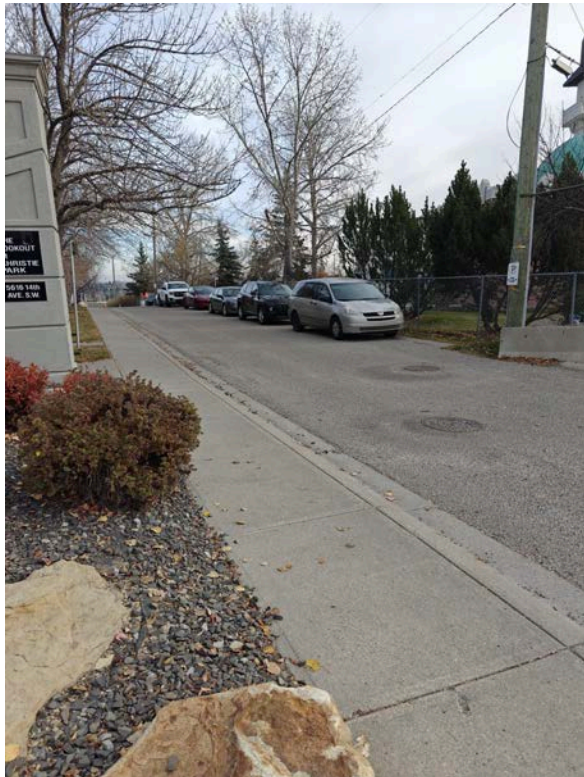
Taken Nov 1, 2024