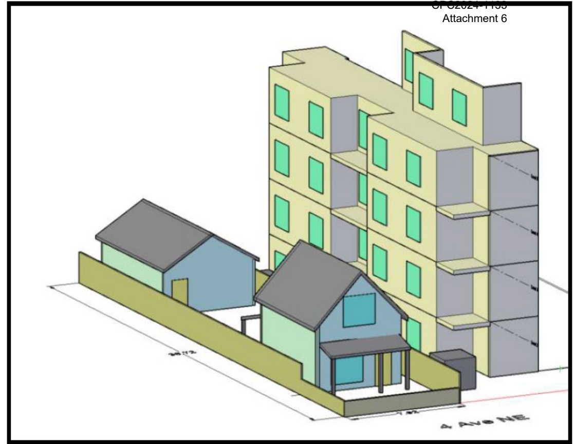
South West Isometric

These drawings show the proximity of the development to our property, intruding on our privacy and how the windows and balconies from the 2 nd floor onwards would see directly into our bathroom skylight.