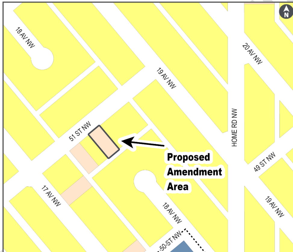
Figure 1.3 Future Land Use Plan