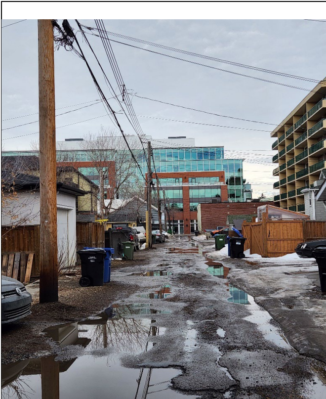
Very narrow single lane (looking east to 4 th ST SW). Note tightness of buildings at exit creating “blind spot” entry to 4 th ST SW. Hydro poles, garbage bins, etc. create tight access route. Picture #1