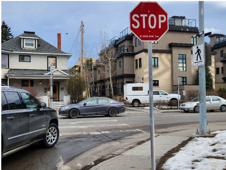
Looking across 5 th ST SW to lane from west side of 5 th St SW (Royal Avenue intersection). Note busy traffic (typical) and cross walk. Picture #3