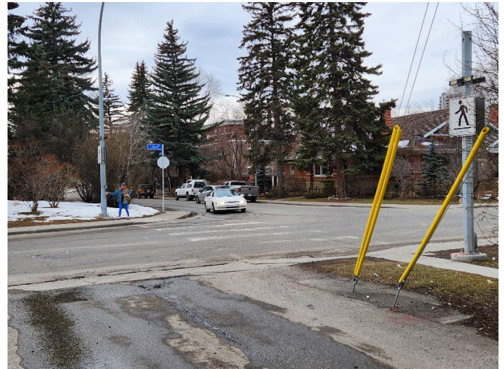
Cross walk on 5 ST SW looking west from back lane. Note that busy 2-way traffic, cross walk, sidewalk, unmarked cycle lane (used in good weather) and staggered intersection (Royal Ave SW and back lane) all converge at this exit point. Picture #4