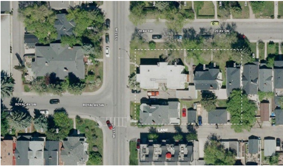
Back-lane pictures (between 21 st Ave SW and 20 th Ave SW and running east from 5 th St SW to 4 th St SW)

My name is Wayne McNeil. I am here representing the 9 town house owners/residents of Mission Crossing located at 21 st Ave and 5 th ST SW, Calgary. Given the City’s documented priority to “improve safety” as a key consideration for redevelopment (per various published Area Plans), we are opposed to the application to amend the Land Use Designation adjacent to our properties. [CLIFF BUNGALOW , LOC2024-0041, BYLAW 301D2024]