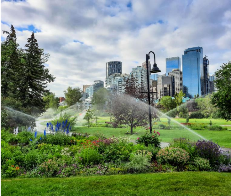
Water Utility Bylaw