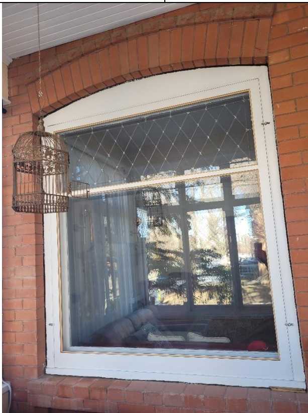
(Image 2.8: example of 1-over-1 window with decorative diamond patterned upper sash; segmental arch brick headers topped with rusticated course and protruding double course brick sills)