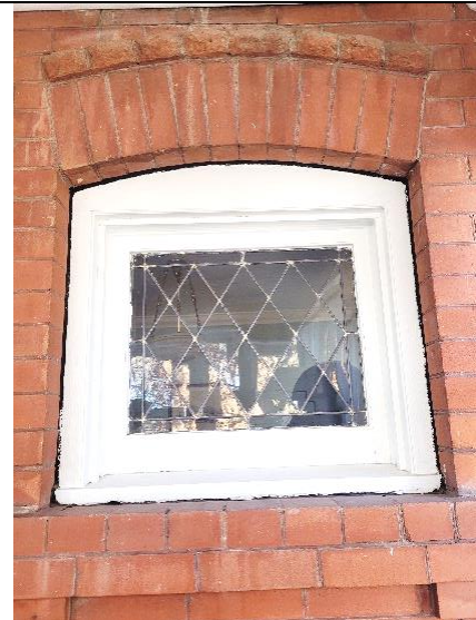
(Image 2.7: example of single sash window with decorative diamond patterned)