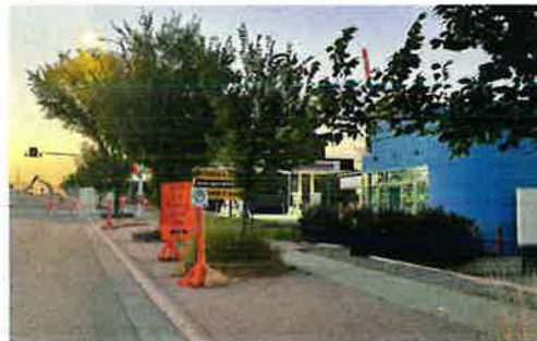
Temporary parking and loading zones