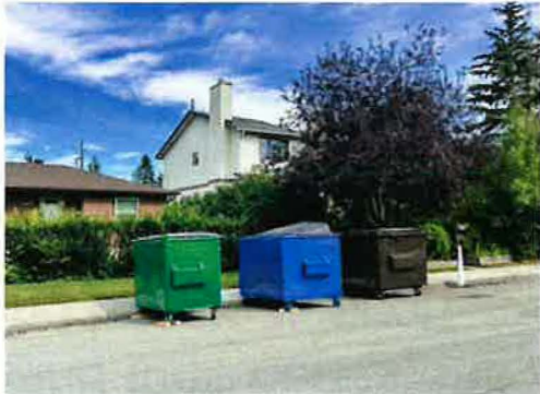
Shared Waste Bins