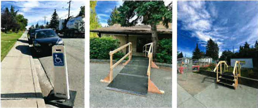
Alternate Access and Accessibility