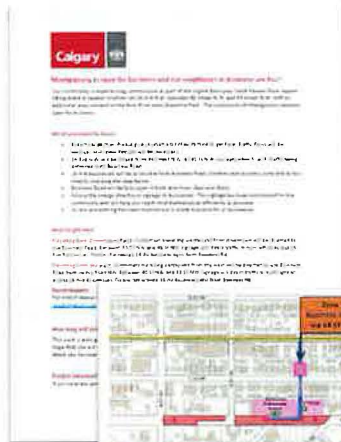
Digital “know before you go” materials for businesses to share with their customers