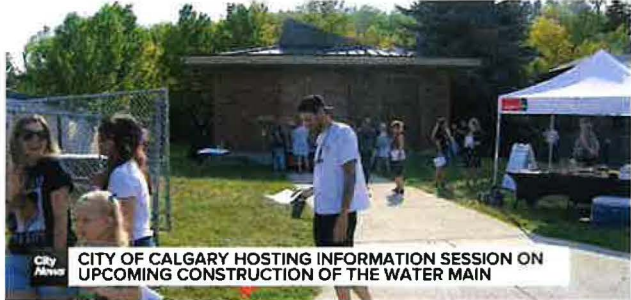
Pop Up Information Session