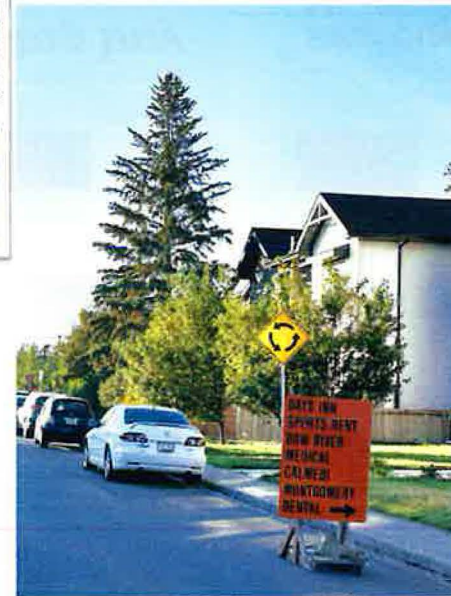
Custom Business Wayfinding Signs