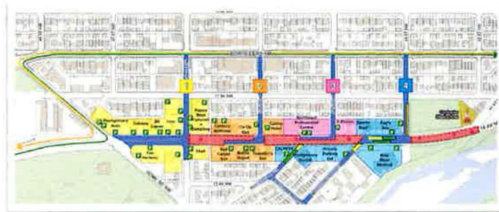
Comprehensive business wayfinding strategy for 16 Ave Businesses in Montgomery