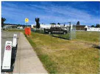
Temporary Parking Lot (by permit)