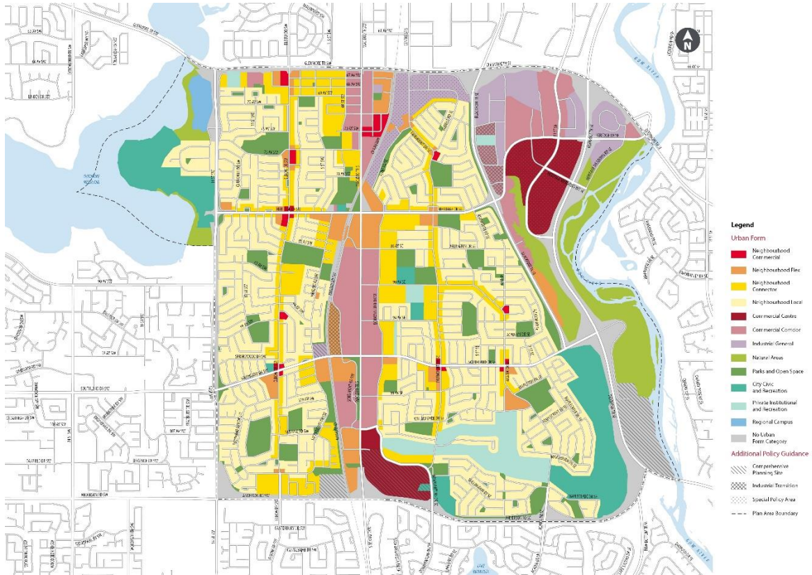
Map 3: Urban Form