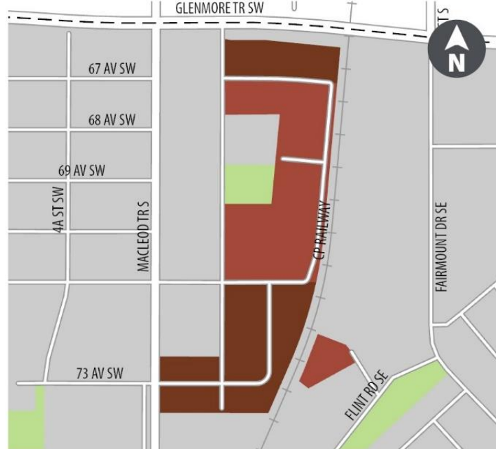
Figure 14: Midtown Building Scale with LRT Station and Affordable Housing