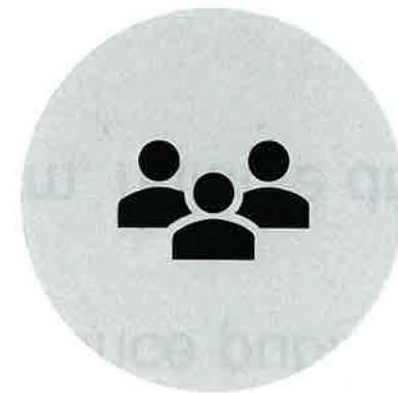
PANEL MEMBERS EXPERTS WITH CONSULTANT SUPPORT